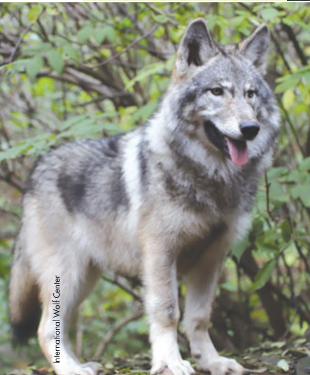
International Wolf Center

Take a look at these photos of ambassador wolves Axel, Grayson and Rieka at six months old, and try your hand at the other activities on these pages.