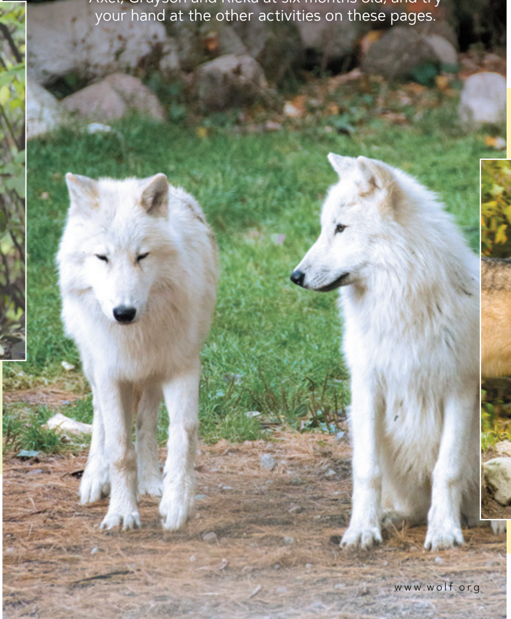
International Wolf Center