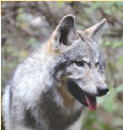
International Wolf Center

Adult Survive Grow Hunt Fall Travel Wolf Spring Pup Winter