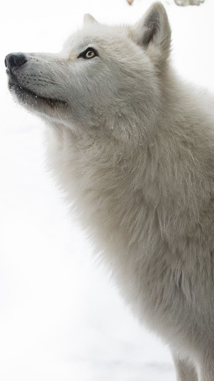
PHOTO: Grayson is one of two arctic wolf pups that arrived at the International Wolf Center in 2016.