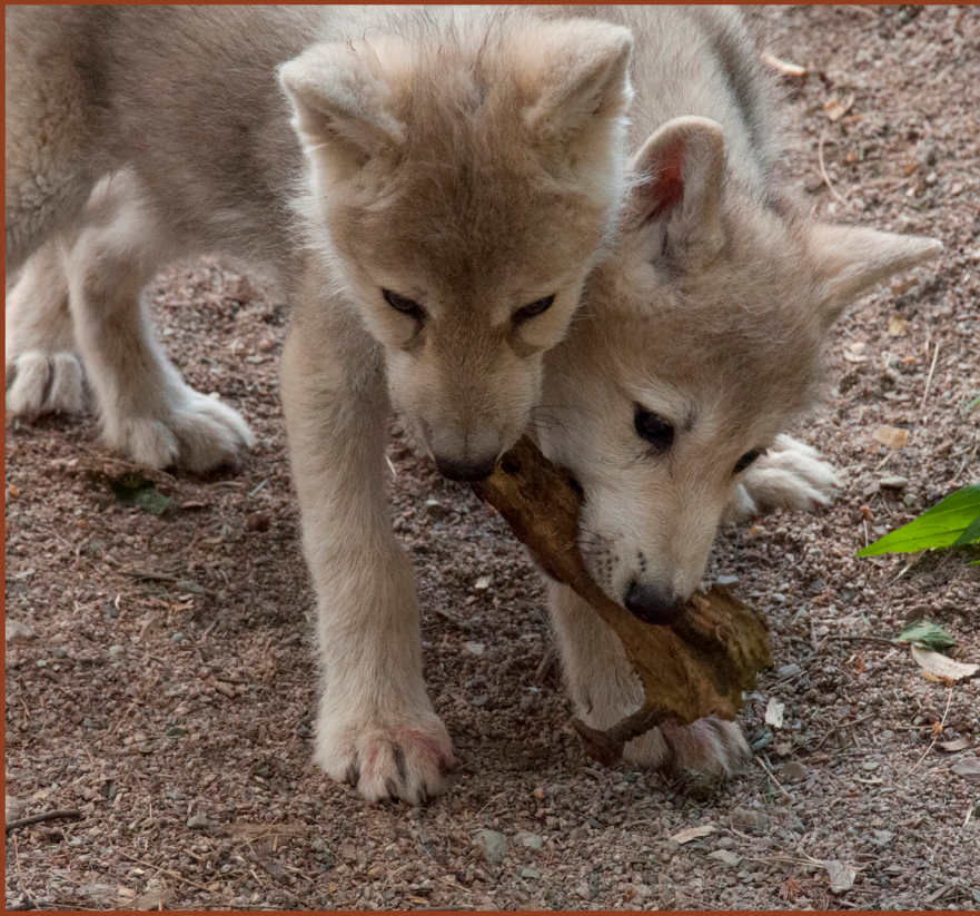
ABOVE: Axel and Grayson each try to get hold of a bone