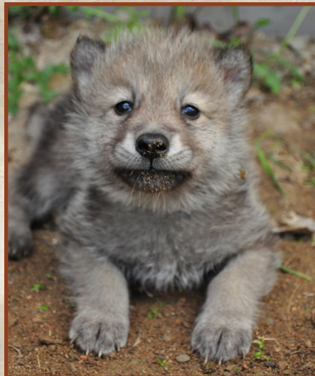
RIGHT: Axel is pictured while a pup. Soon after this image was taken, his coat began to change white.

2016's highlight was certainly the arrival of two new arctic wolf pups. The pups, which were later named Axel and Grayson, were flown to the United States from a facility in Canada and arrived at the Center in May. The pups travelled well, accompanied by specialists who monitored their health the entire trip. After permits were reviewed and the two male pups passed their medical examination, they made the final leg of their journey to the Center's new Wolf Care facility in Ely.