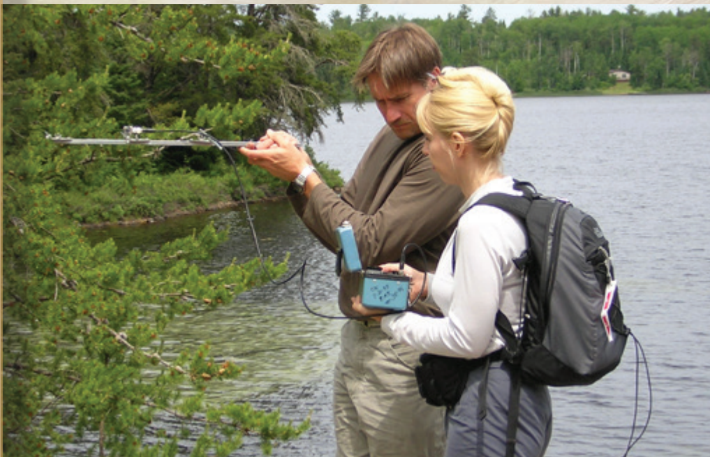
PHOTO: Telemetry is used to track wolves