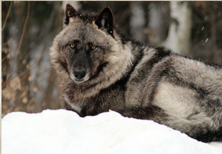
LEFT: Luna

The Exhibit Pack was managing well, with Luna showing some signs of defensive behavior, especially around food. Her fellow packmates seemed to adjust to this behavioral response, and the veterinarians believe she may have some underlying issues with her vitamin D deficiency and bone density that could be affecting her metabolism. They were also concerned that the malformation of her femoral head might be causing her pain making her proactively defensive to compensate for her vulnerability. Staff started training on some body work techniques to help reduce Luna's discomfort. Grizzer had a bit of a challenge during the fall of 2015 when construction activities began for the new annex. Blood work revealed that he had some low liver values, which prompted staff to add milk thistle as a nutritional supplement to his diet. He is definitely still active, displaying the Grizzer 500, which includes a playbow to staff followed by a race around the enclosure, darting in and out of wolf care staff in a version of keep-away.