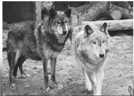
On May 21, 2008, MacKenzie (left) died, leaving Lakota (right) as the lone surviving member of the Retired Pack.

the Exhibit Pack: it will be more dynamic than at any time in the Center's history. We invite you to watch the events unfold from the viewing windows at the Ely, Minnesota, interpretive center, through the wolf logs and webcam at www.wolf.org or by a special distance-learning broadcast to your school or organization. ■