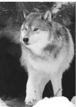
International Wolf Center