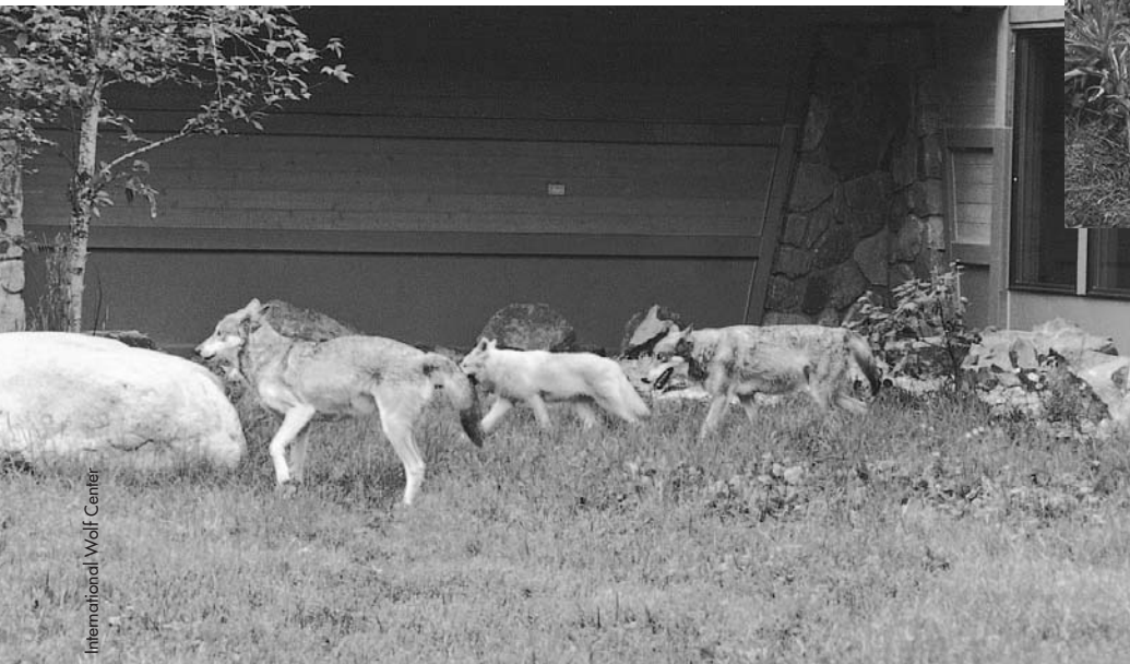
International Wolf Center