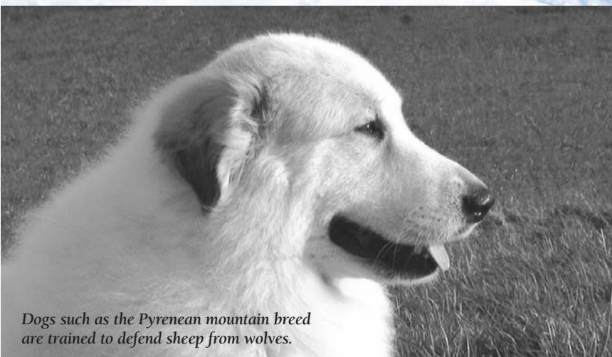
Dogs such as the Pyrenean mountain breed are trained to defend sheep from wolves.

No one in the Maurienne range is quite sure what is going on—or, at least, few people admit to knowing much. Everyone is clear about one thing, however. The killings are related, in some way, to the long battle that has been waged between shepherds and wolves—and between sheep-lovers and wolf-lovers—since the European grey wolf, Canis lupus , decided to recolonise France from Italy 16 years ago.