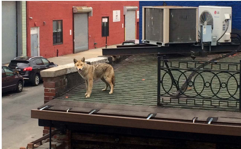
Fig. 3. Coyote on roof in New York City, USA, thought to have come from exploring nearby buildings as part of a larger urban coyote population (Bittel 2015).

had stopped to watch them (Heilhecker et al., 2007). In 2012, authorities had to kill eight wolves in Ironwood, Michigan (population 5000) (Kovarik, 2012). A few Wisconsin wolves also had to be destroyed because of their regular proximity to people (Olson et al., 2015a).