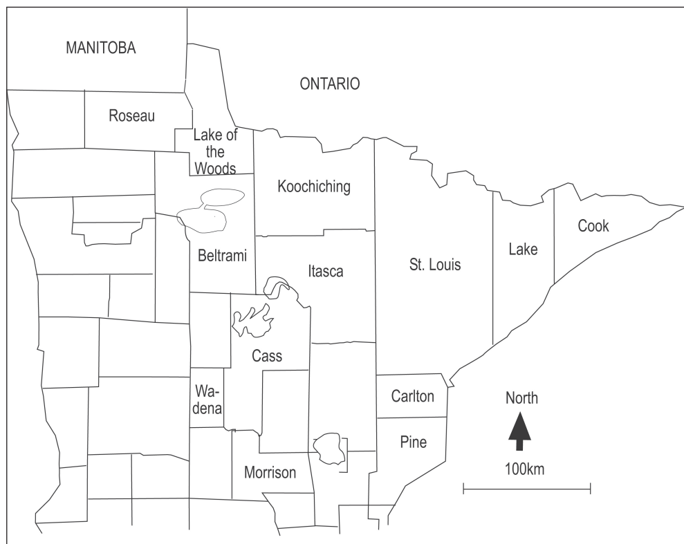
Figure 1. Northern Minnesota counties in wolf range where ear lengths were collected.

As part of a long-term ecological investigation in northeastern MN from 1999 through 2008 (Mech 2009), biologists and technicians measured ear lengths of each wolf live-trapped and anesthetized. The wolves were weighed, and their ages estimated by comparing tooth wear with the wear charts by Gipson et al. (2000). This research was conducted under both state and federal endangered species permits and complied with guidelines of the American Society of Mammalogists (Animal Care and Use Committee 1998). Technicians measuring ear lengths in recent MN wolves were instructed to measure them