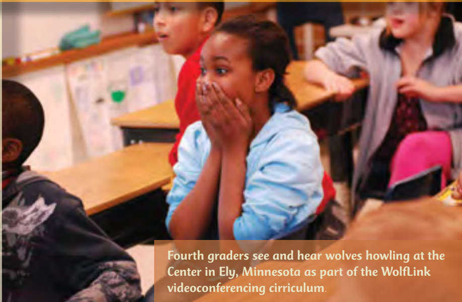
Fourth graders see and hear wolves howling at the Center in Ely, Minnesota as part of the WolfLink videoconferencing curriculum.