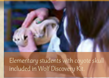
Elementary students with coyote skull included in Wolf Discovery Kit.

"I want to thank you for all the hard work you are doing! As I explore this Web site, I feel like I am learning more and more about wolves in general and your Center in particular every time I return."